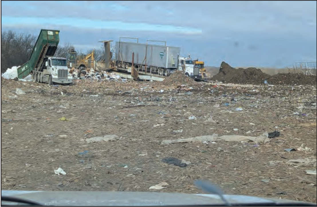
Tipper with stockpiling of cover on East side