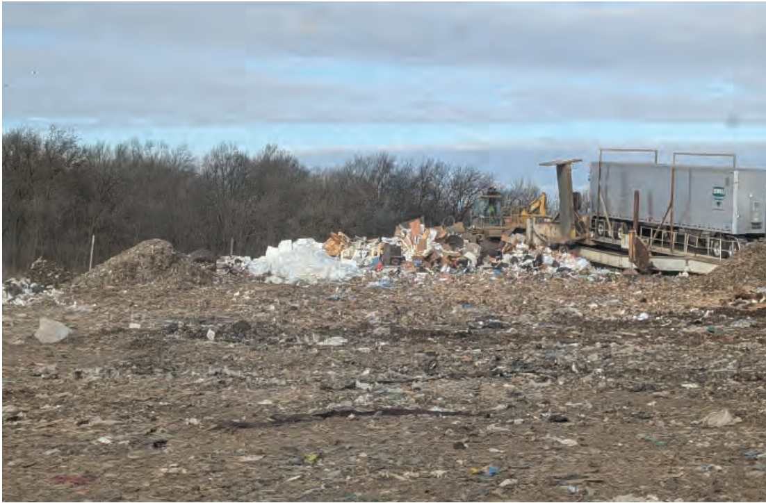
Tipper aimed into Northwest corner of Phase 4