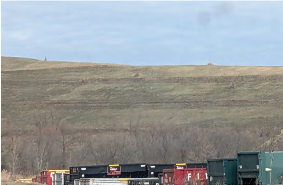
West slope of cap project, vegetation is developing quickly