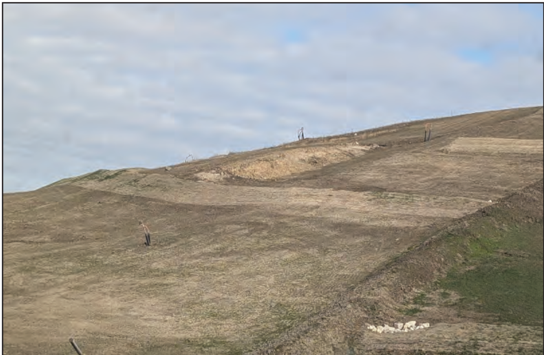
Northwest corner of Phase 3, slow to green