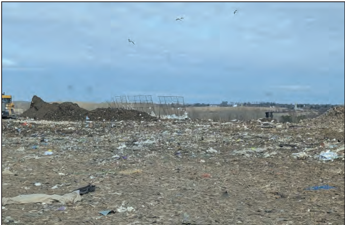
Active area in Phase 4