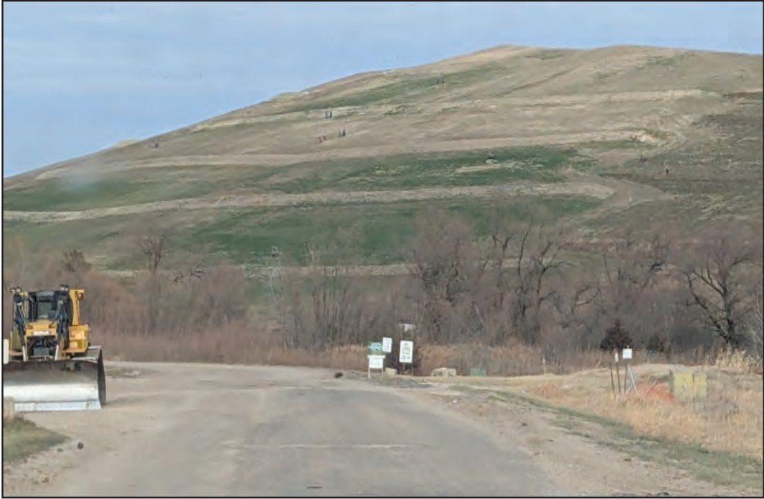
West slope of cap project, vegetation is developing quickly