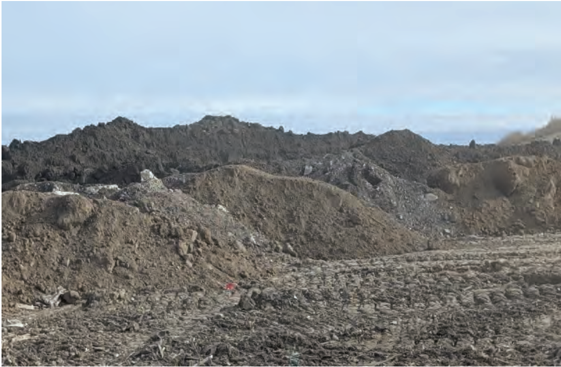
Plethora of soils tipped in Phase 4 for cover