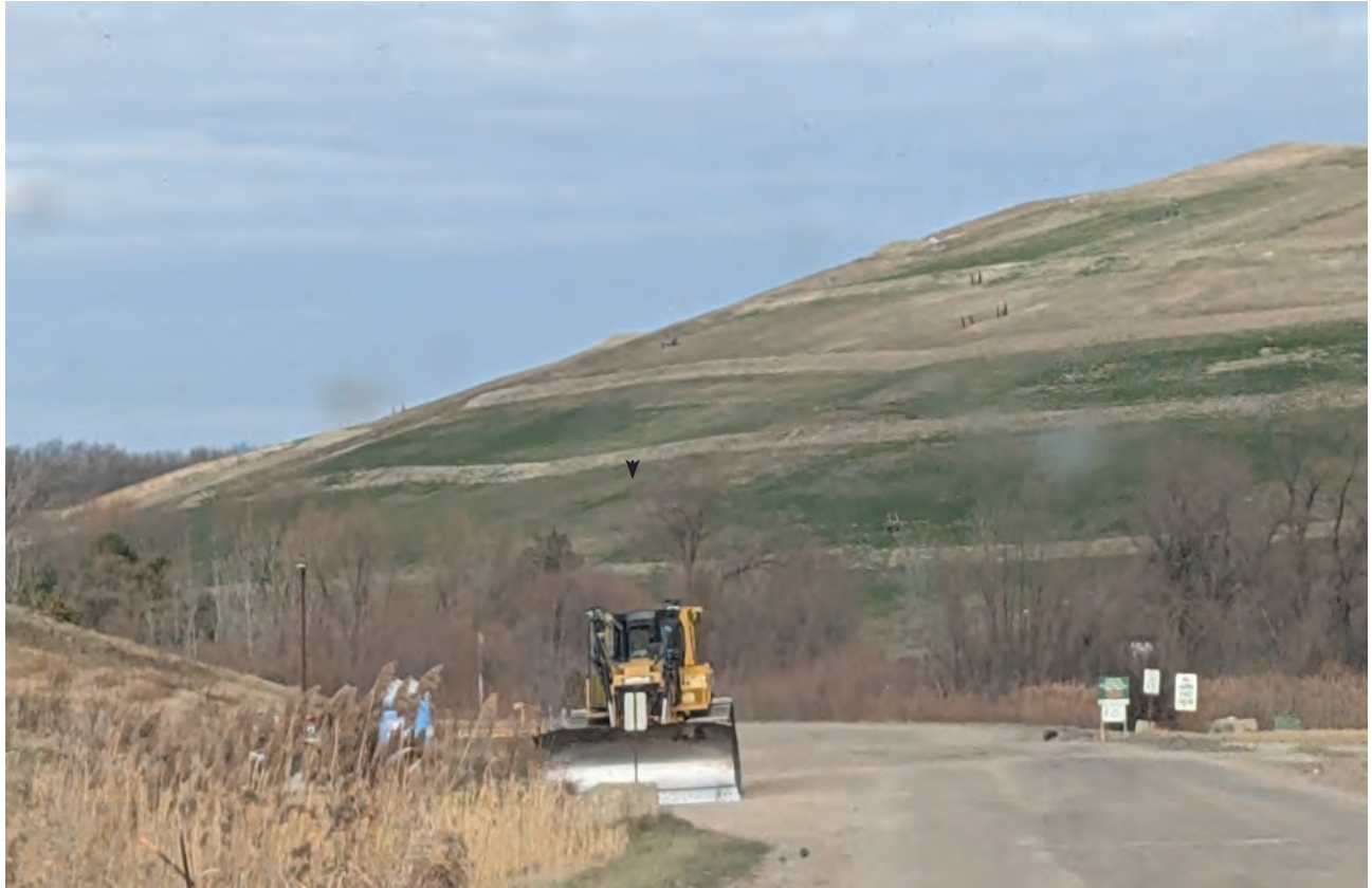
Dozer spreading tailings to smooth access roads