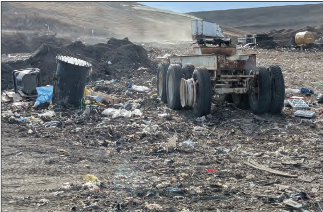
Tipper carrier placed adjacent to gas well to protect it