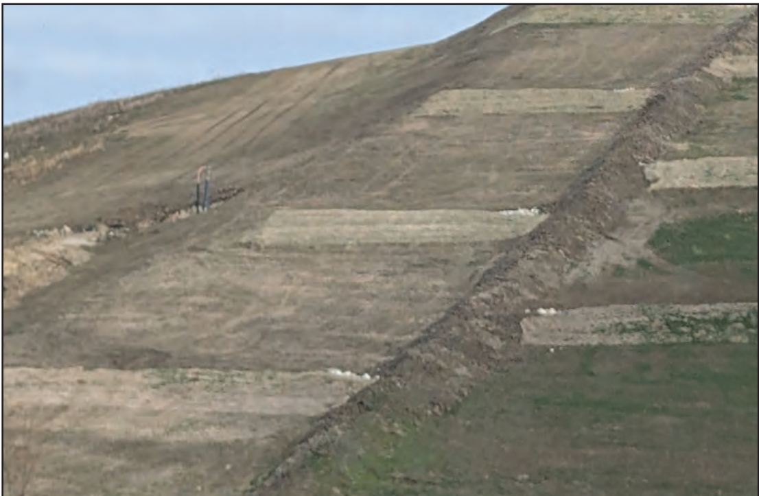
Transition of cap to capless of Phase 3