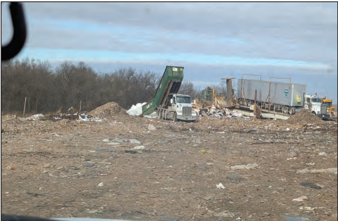
Truck tipping into working face in Northwest corner of Phase 4