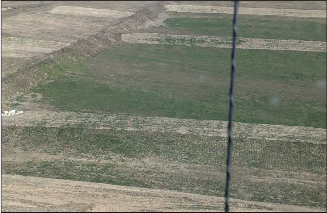
Cap project greening rapidly