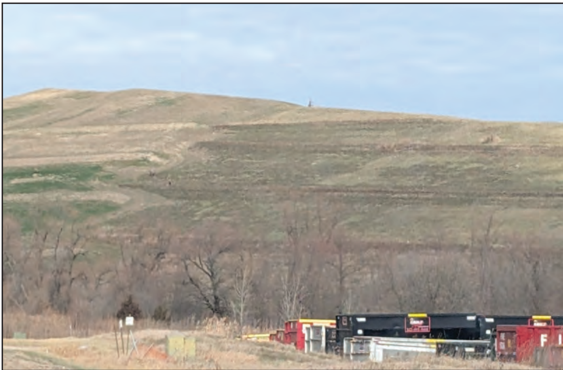
West slope of cap project, vegetation is developing quickly